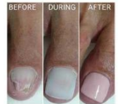
Toe Nail Correction