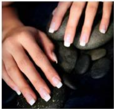
Hard Gels Acrylic alternative