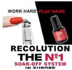
REOLUTION THE N o 1 SOAK-OFF SYSTEM IN ETUDE - Soft Gel - Nail Polish Gel