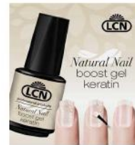
Nail Restoration & Protection